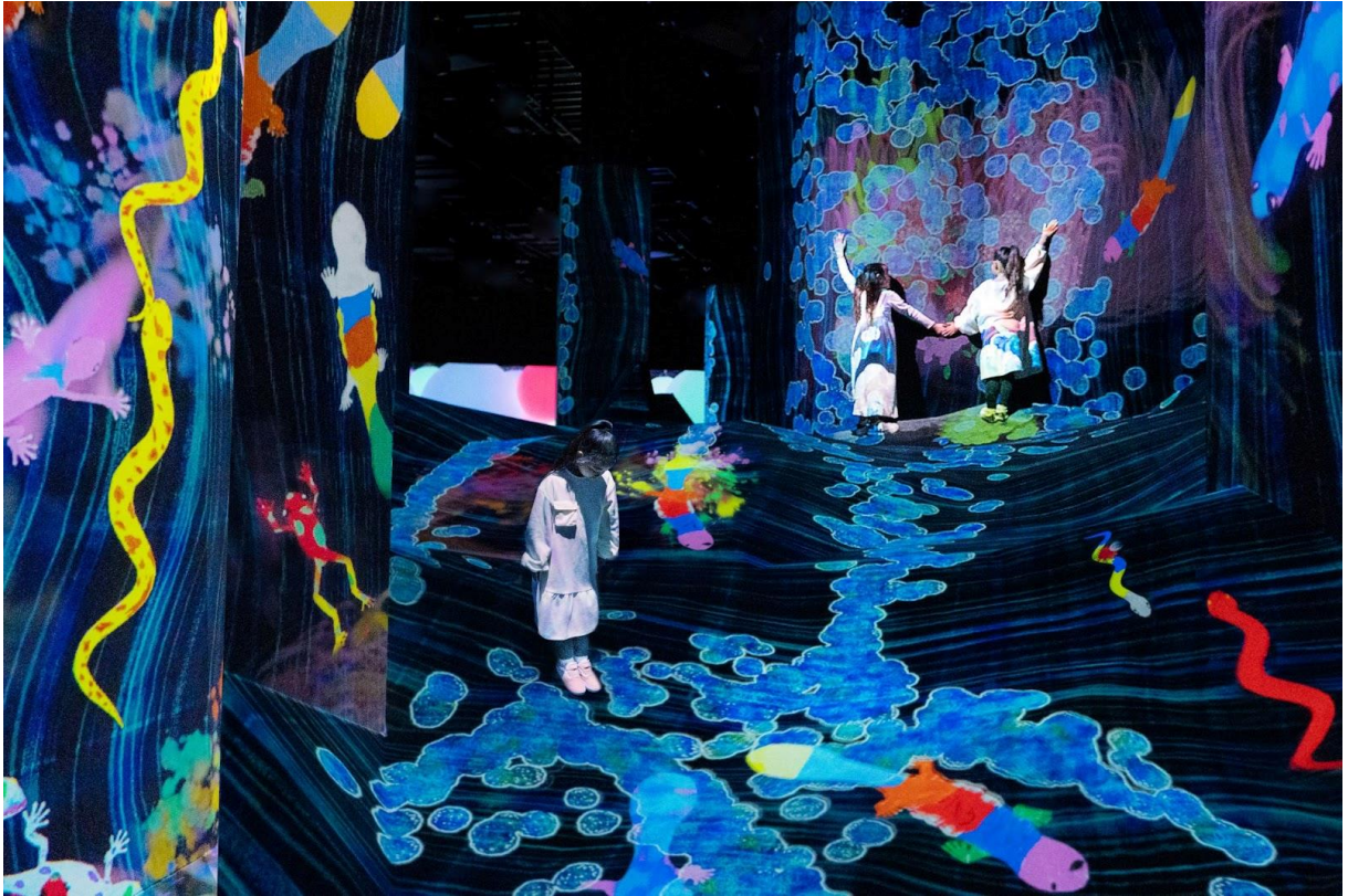
Photo 3: teamLab Waterfall Droplets, Little Drops Cause Large Movement (Click here to download high resolution photo)