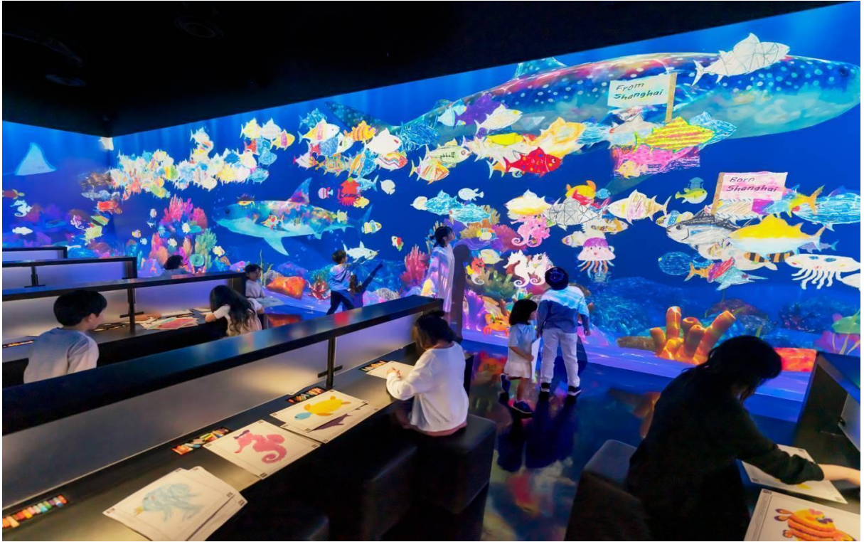
Photo 5: teamLab Sketch Aquarium: Connected World ® teamLab (Click here to download high resolution photo)