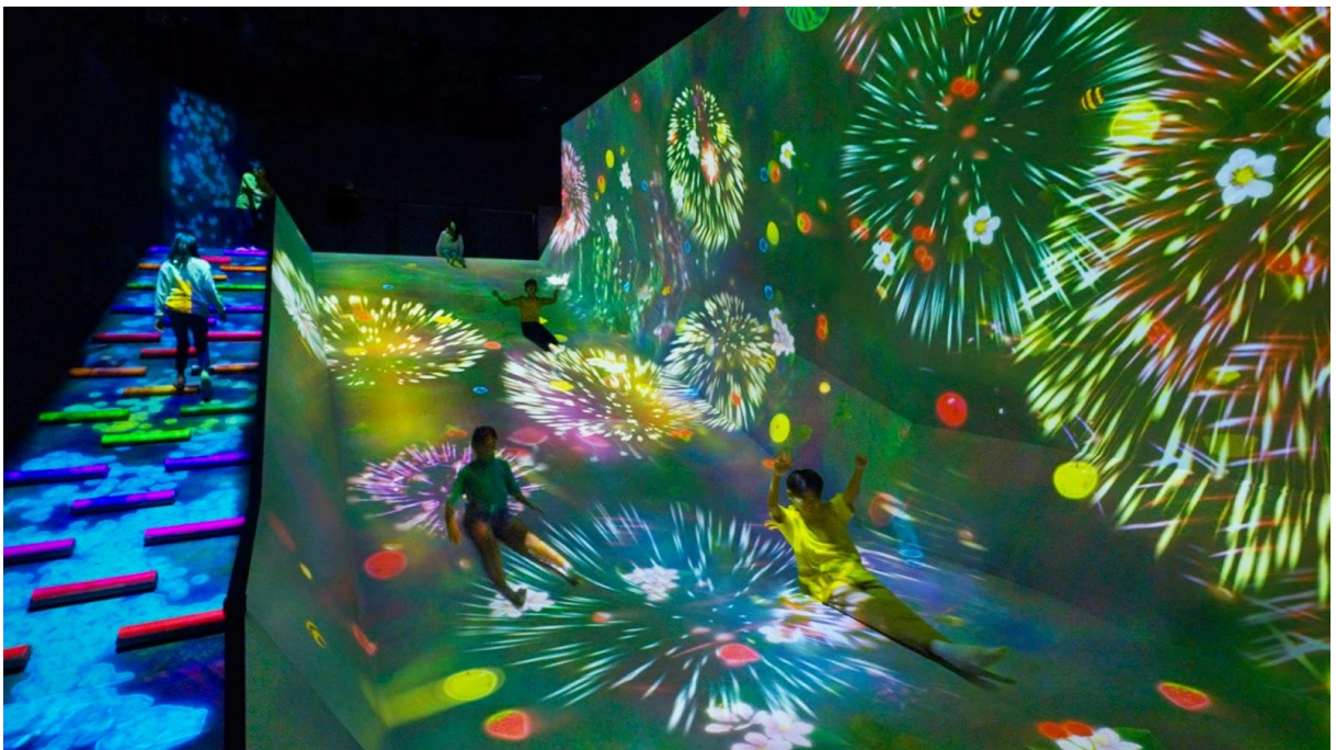
Photo 4: teamLab Sliding through the Fruit Field (Click here to download high resolution photo)