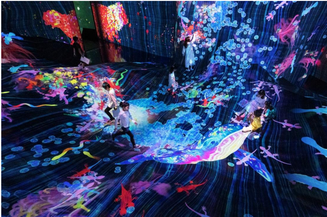
Photo 1: teamLab Graffiti Nature - High Mountains and Deep Valleys, Red List (Click here to download high resolution photo)

(OKINAWA, JAPAN) DFS Group, the world's leading luxury travel retailer, is pleased to announce the launch of permanent, exclusive exhibition of " teamLab Future Park Okinawa " on the third floor of T Galleria by DFS, Okinawa. The interactive digital art space opened on December 15, 2023.