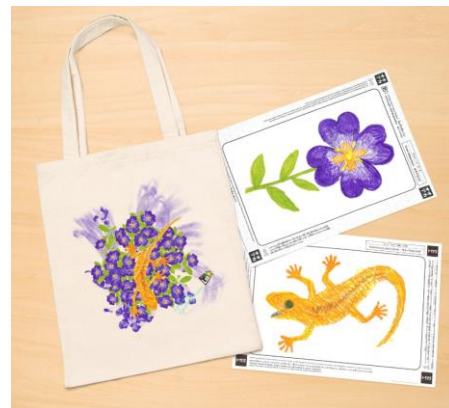
Photo 10a and 10b: At the teamLab “Sketch Factory” ®, visitors can turn their own drawing into memorabilia to take home with them. The drawings created in “Graffiti Nature” or “Sketch Aquarium: Connected World” don’t just move around in the artwork space, they can be also made into a tin badge, towel and T-Shirt and other souvenirs. (Click here to download high resolution photo 10a and Photo 10b )

“teamLab Future Park” is an exhibition that can be enjoyed by both children and adults. Since its first exhibition at the Ryubo department store in Okinawa in November 2013, it has been held in Sydney, Bangkok, Shanghai, Turin, Budapest, Jakarta, Johannesburg, and other cities around the world, with permanent exhibitions in Singapore, Dubai, Shenzhen, etc. To date, more than 15 million people around the world have experienced the exhibition.