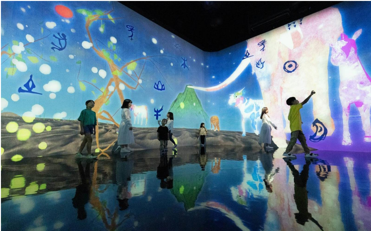
Photo 9: teamLab Story of the Time when Gods were Everywhere ® teamLab (Click here to download high resolution photo)