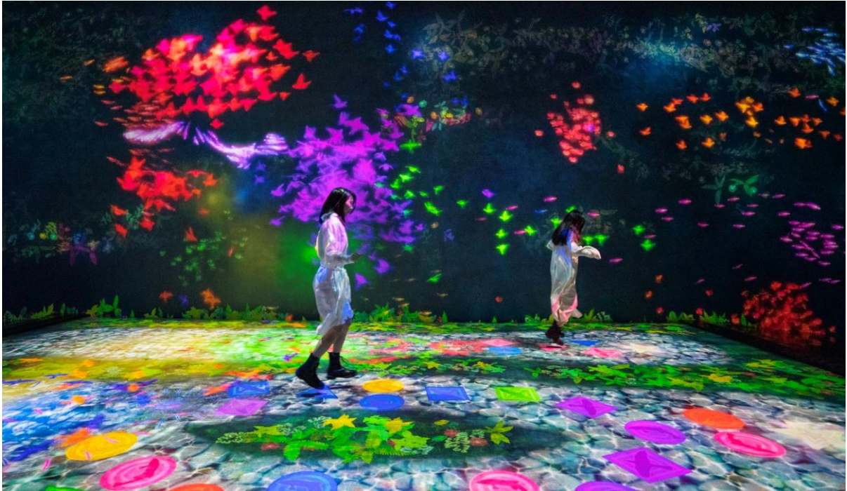
Photo 7: teamLab Hopscotch for Geniuses: Bounce on the Water ® teamLab (Click here to download high resolution photo)